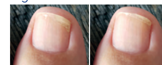
Before treatment 3 Months

The images below show examples of a nail at different time points during the course of treatment.